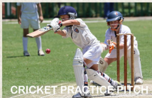
CRICKET PRACTICE PITCH