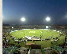
International Cricket Stadium

Mohali has long been recognised for the International Cricket Stadium, Punjab Cricket Association IS Bindra Stadium, but it has now evolved into one of the city's top facilities. Despite this, the city has excelled in the education, medical, and job sectors, all beneficial to the community. Mohali is also an IT hotspot, with good connectivity to Delhi, nearby cities, and locations within a reasonable distance. Other attractions in Mohali include shopping malls, the International Airport, a golf course, and the ISBT Mohali, which are all key features that make Mohali real estate appealing