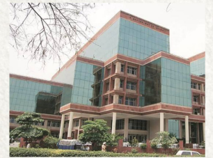
Commercial and IT Hub